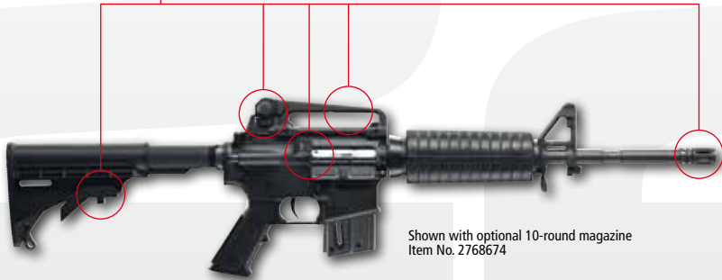
Shown with optional 10-round magazine Item No. 2768674