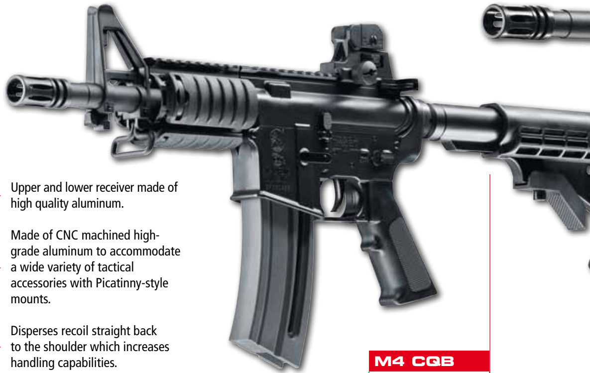
M4 CQB Item No.: 2770016