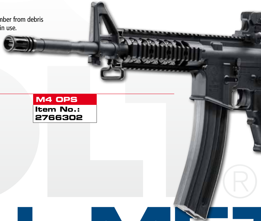
M4 OPS Item No.: 2766302